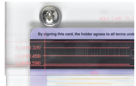
Portion of developed card with Q-View magnetic developer